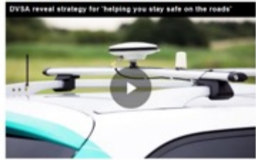
Driving lessons were suspended by the Driving Vehicle and Standards Agency (DVSA) at the start of the coronavirus outbreak but restrictions could soon be lifted. Experts at Bill Plant Driving School advise driving lessons remain suspended for the time being but restricted restrictions could be eased by July 6.

This is the date "many in the industry" are aiming for as a potential resumption date for students to return to the roads. However pupils who were ready to take their driving test will need "at least a couple of weeks" of extra tuition before taking their exam.