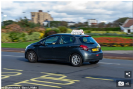
Handbrake on for learners: The DVSA has confirmed this week that driving lessons and tests will remain suspended with no return date

Driving instructors have targeted 6 July as a return date for lessons to restart, though until further notice will only be allowed to provide emergency training for those deemed to be critical workers.