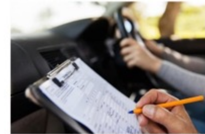
Driving tests were initially suspended, but candidates will now have to rebook

The situation has left many learners in limbo, unable to continue learning or to sit their test, and self-employed instructors wondering when they can return to work. But as restrictions on many areas of life are eased there is hope that driving instruction could resume soon.