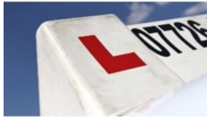
Driving lessons have been on hold since March