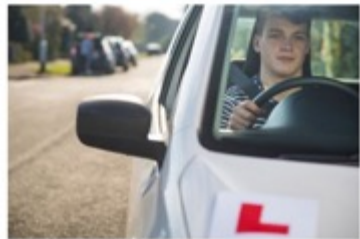
Some test centre pupils will need extra tuition

He also confirmed any new bookings would be "on hold" for the time being as schools dealt with a key backlog of students.